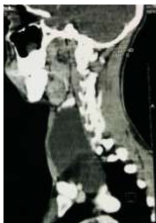
Fig 4. Sagittal frame of CT showing the lower extent of the swelling encroaching mediastinum

The patient was taken up for excision of mass. Under general anaesthesia, a horizontal incision was taken in the neck crease. The subplatysmal flaps were elevated. The swelling was delineated except in the region of inferior extent. The meticulous dissection was done with separation