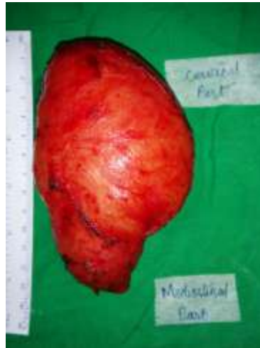
Fig 5. Cystic hygroma specimen