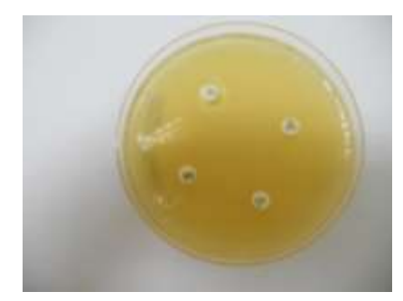
Fig:3 ESBL Producing Klebsiella pneumoniae