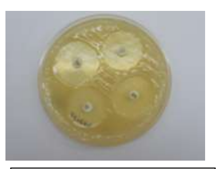
Fig:4 Non-ESBL Producing Klebsiella pneumoniae

Fig:5 AMP C Beta lactamase Producing Klebsiella pneumoniae