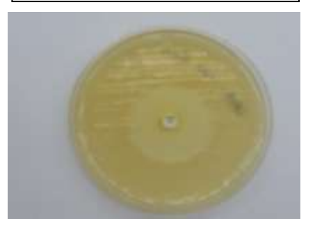
Fig:10 Non Carbapenemase producing Klebsiella pneumoniae