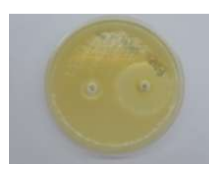
Fig: 8 Confirmatory test for ESBL Producing Klebsiella pneumoniae

Management and treatment of ESBL-producing K. pneumoniae infections can be challenging and is evolving. To date, there have been no clinical trials that evaluate the comparative efficacy of antibiotics in the treatment of infections caused by these